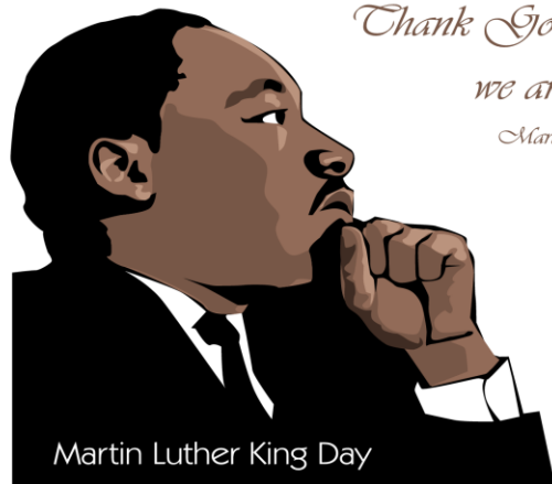
Martin Luther King Day